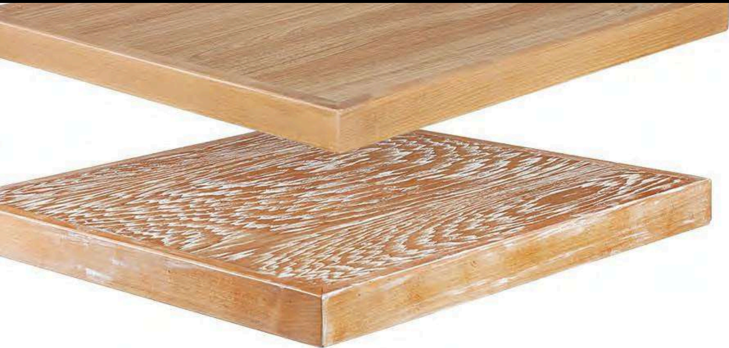
Laminated tops with Solid wood edge